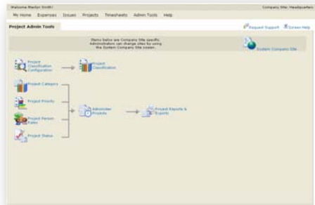
Intuitive administrative tools get you started more quickly