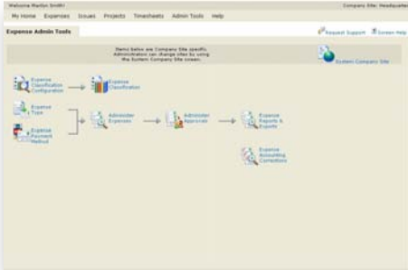
Intuitive administrative tools get you started more quickly